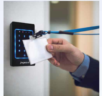
Personal access control