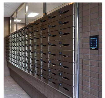
Management system for locker or mail box